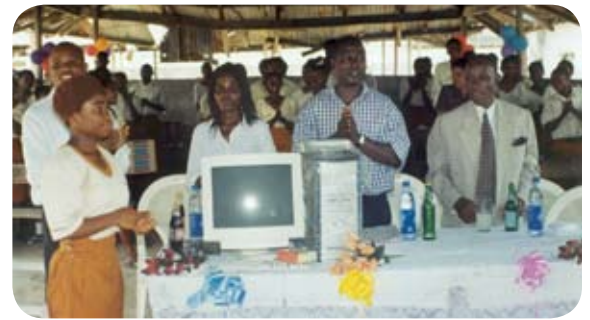
KIND present a new computer to Judith's school.

Prizes awarded include Yamaha Generators and a desktop computer to Ajeromi Ifelodun High School, Ajegunle, Lagos; Anglican Commercial Grammar School, Osogbo, Osun; and Government Senior College, Agege, Lagos. KIND will continue to expand the reach of its June 4th programme by engaging secondary schools in more states in 2006.