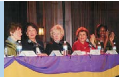
Cross section of speakers at public forum.

On November 2nd the Synergos Institute organized a University for a Night in New York that brought together 420 distinguished people to discuss ways to launch new action to reduce unacceptable levels of poverty and human suffering, reverse severe environmental degradation and overcome wrenching dislocations and fragmentation within and between societies.