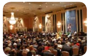
Cross section of audience at Synergos event.

For more information visit: www.synergos.org